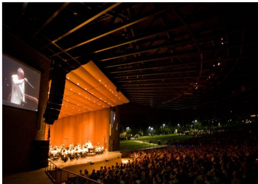
The New York Philharmonic performs at Bethel Woods Center for the Arts, on the Woodstock site in Sullivan County, on June 28, 2008.