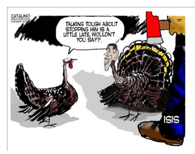
Ken Catalino (/political-cartoons/2015/11 /24/136948)