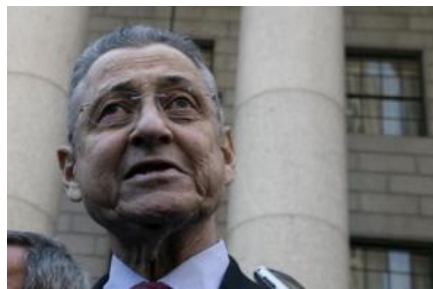
Former New York State Assembly Speaker Sheldon Silver makes a comment to the media as he departs an arraignment ...

Dean Skelos, former Senate majority leader, faces his own criminal trial on Nov. 16. He is charged with taking official ac-