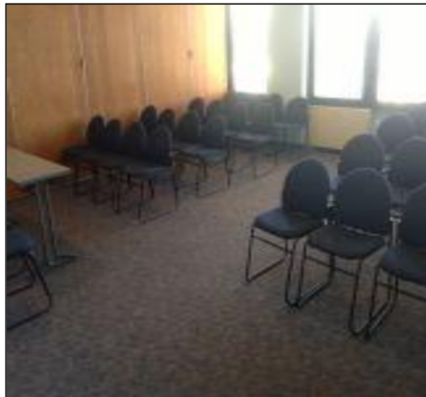
PHOTO TAKEN FROM FRONT OF ROOM:

LOCATION: 4 th Floor, just off elevator to the left. SEATING STYLE: THEATRE WITH HEAD TABLE SEATS IN ROOM: 40 SEATING CAPACITY: 42 NOTES: This room can be ganged with 408 at an additional cost. We only combine this room for special conferences and meetings. This room also has a TV mounted on the wall with cable access.