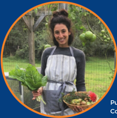
Purslane Nutrition Consulting