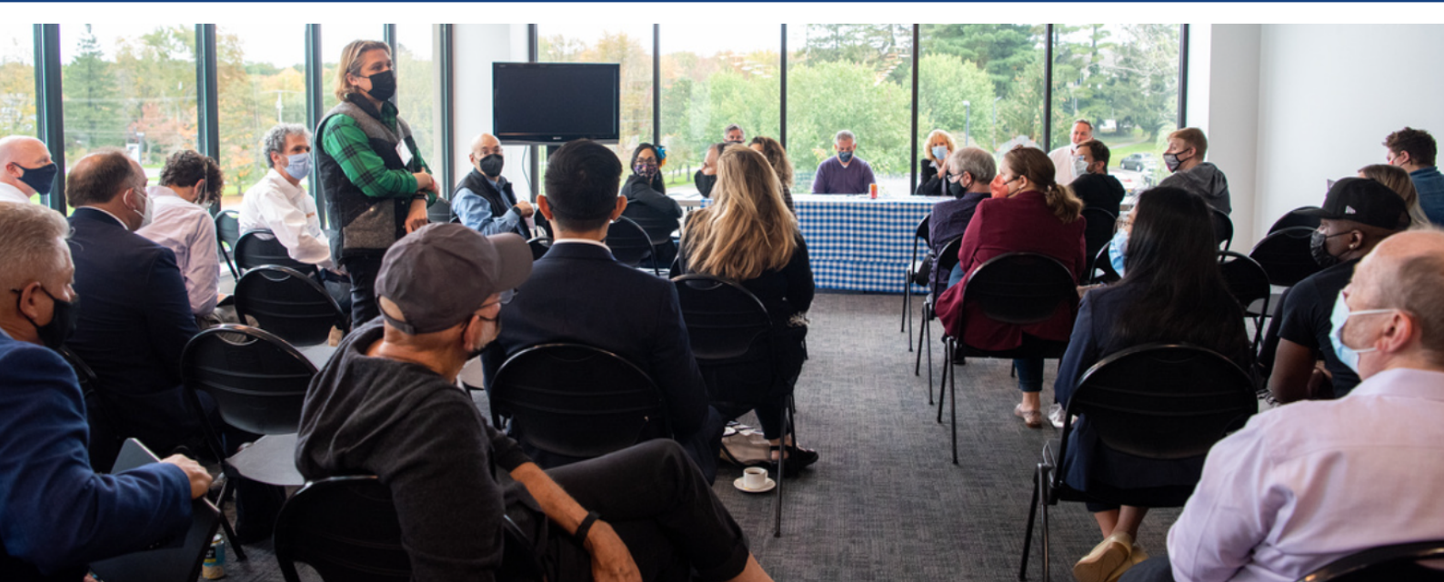
Venture Fest '21

Being housed within SUNY New Paltz, events and online sessions are geared towards sharing knowledge, such as the panel event on branding.