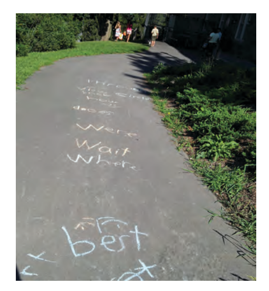
The day was fine and the Summer Literacy Program was outdoors. Follow this path to Old Main!

It's even more remarkable when children actually enjoy the process of reading remediation. The 59 elementary and middle school students enrolled in the School of Education's Summer 2013