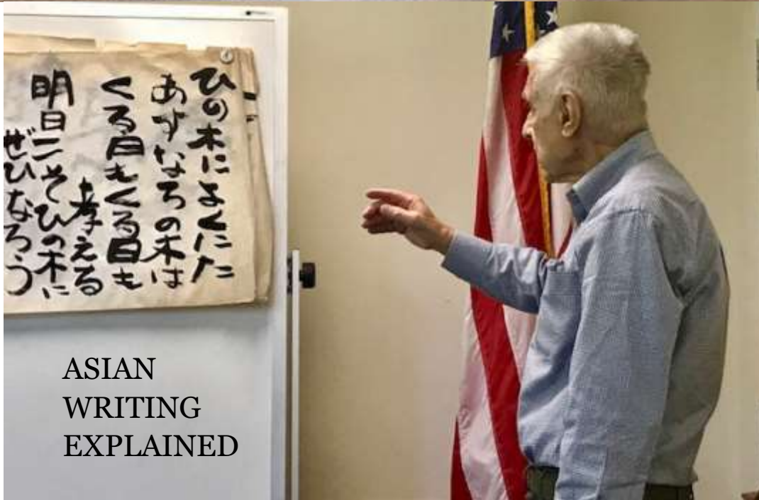
ASIAN WRITING EXPLAINED