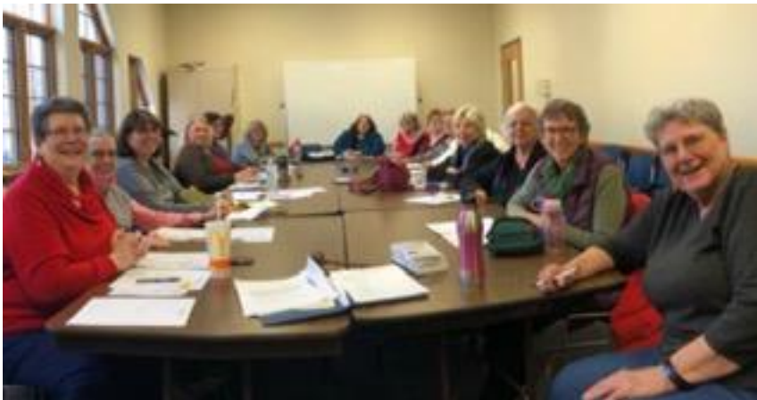
Council Meeting in Progress