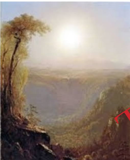
A Gorge in the Mountains (Kauterskill Clove), 1862. Sanford Robinson Gifford (American, 1823–1880)