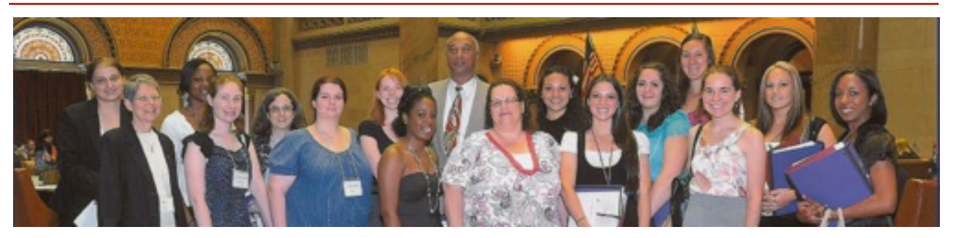
2014 NEW Leadership<sup>TM</sup> New York Summer Institute

A Unique Opportunity at the Center for Women in Government & Civil Society, Rockefeller College, University at Albany