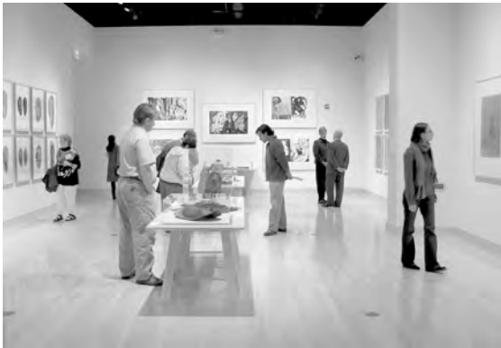
View into the Sara Bedrick Gallery during the opening for Rimer Cardillo: Impressions (and other images of memory)