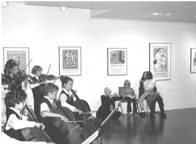
The youth orchestra Flying Fiddlers offers music at the Master of Business Administration Alumni Reception held at the SDMA in October.