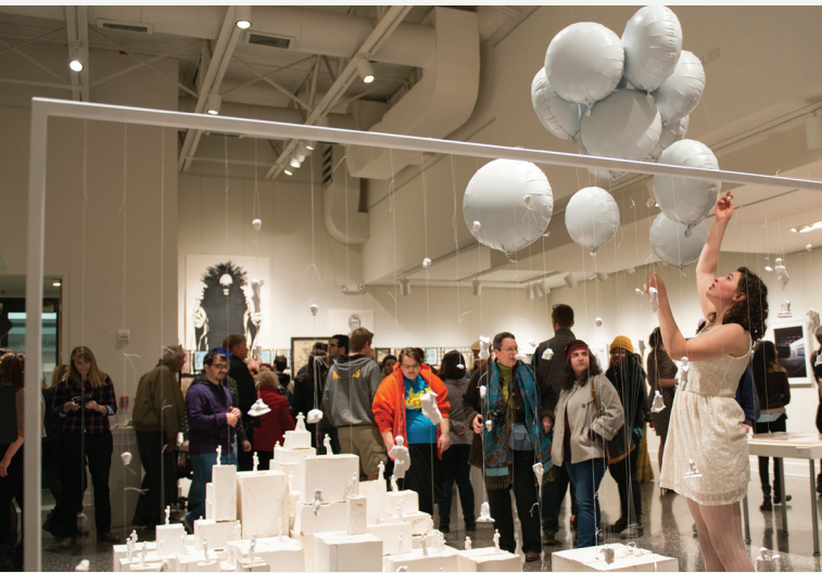
Visitors enjoy recent exhibitions at The Dorsky on the SUNY New Paltz campus.