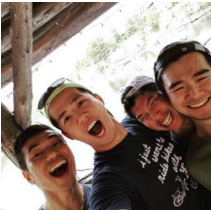
Learning can be all smiles