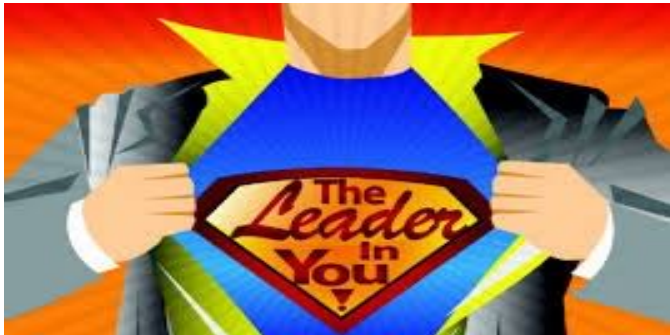
Strong leadership makes LLI strong

On this and the following two pages, we recognize the LLI volunteers whose dedication makes and has made Lifetime Learning New Paltz possible