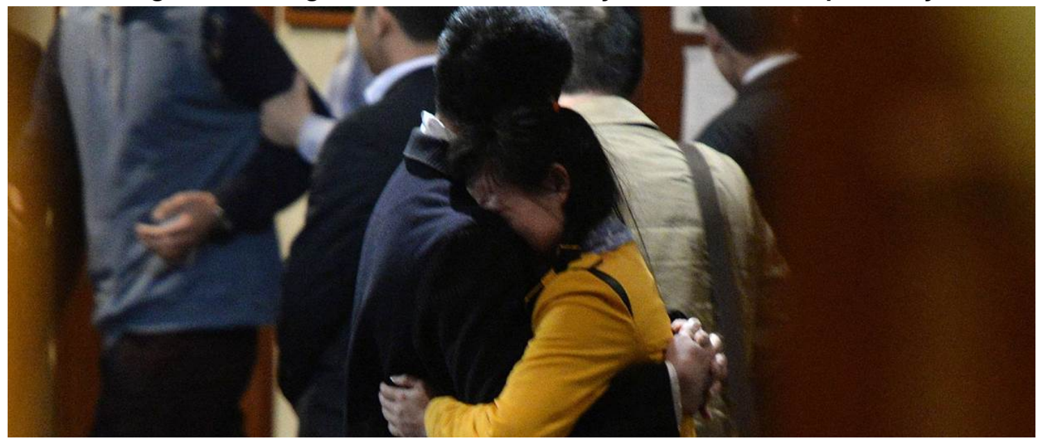
Grieving Chinese relatives of passengers on the missing Malaysia Airlines flight MH370 react after being told of their deaths at the Metro Park Lido Hotel in Beijing on March 24, 2014.