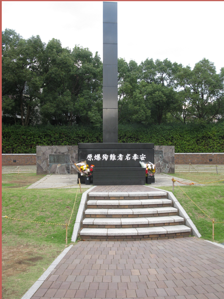
Original Mark planted during the aftermath

Epic-Center of where the atomic bomb (Fat Man) hit Nagasaki