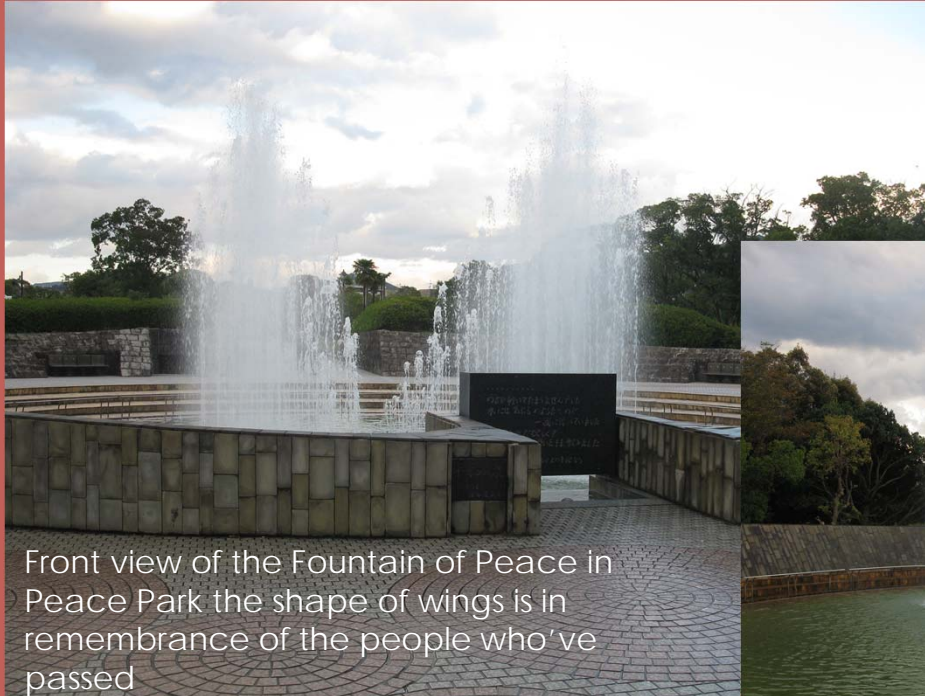
Front view of the Fountain of Peace in Peace Park the shape of wings is in remembrance of the people who've passed