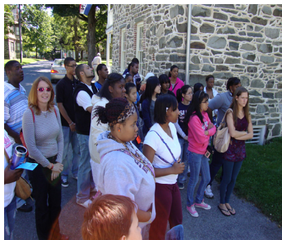
EOP Students and Advisors learning about historical Huguenot Street