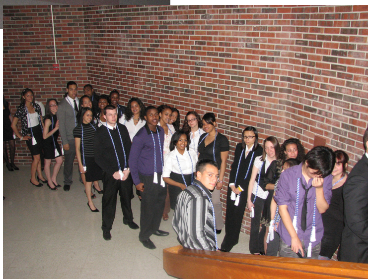
XAE Spring 2010 Inductees