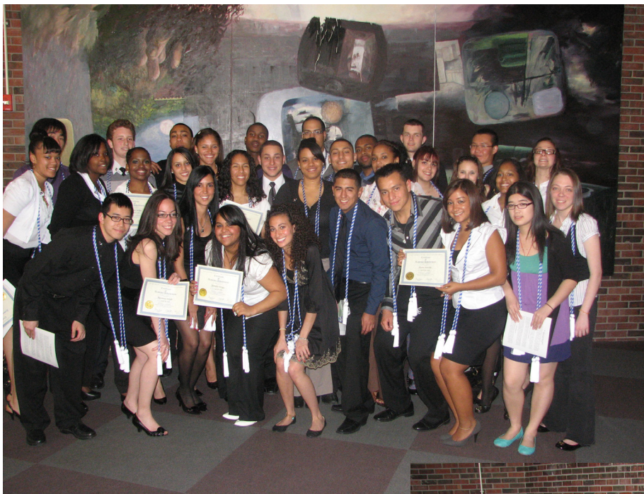
XAE Spring 2010 Inductees