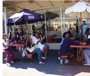
EOP students and Advisors getting Ice Cream