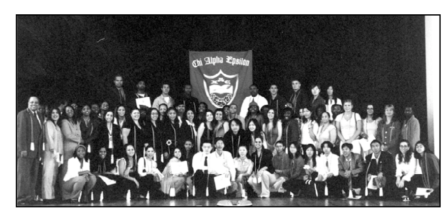
XAE Charter Members, 2003

institutions across the United States, this organization seeks to promote and honor academic excellence.