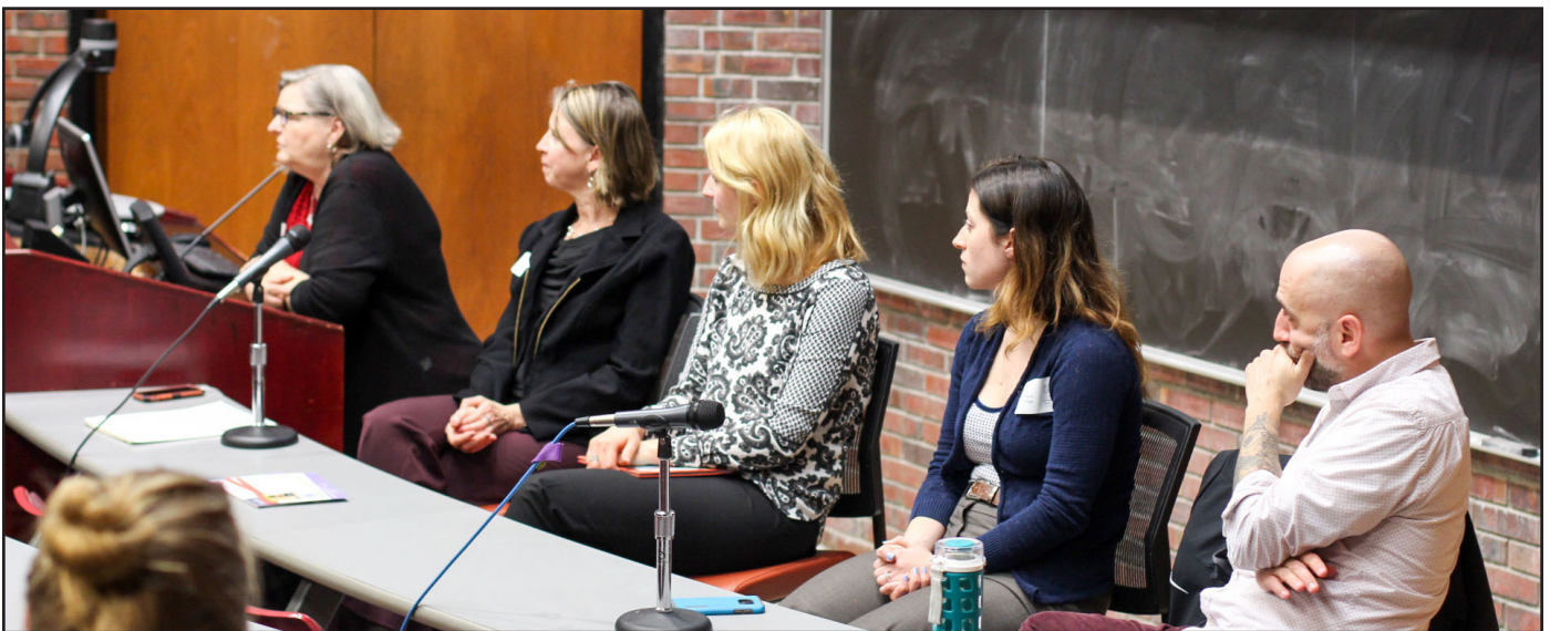
Panelists from history and other departments at the "Women in Politics" conference; Lieutenant Governor Kathy Hochul (top right)