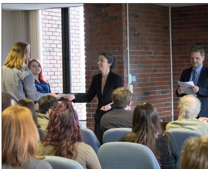
2016 Phi Alpha Theta Induction Ceremony