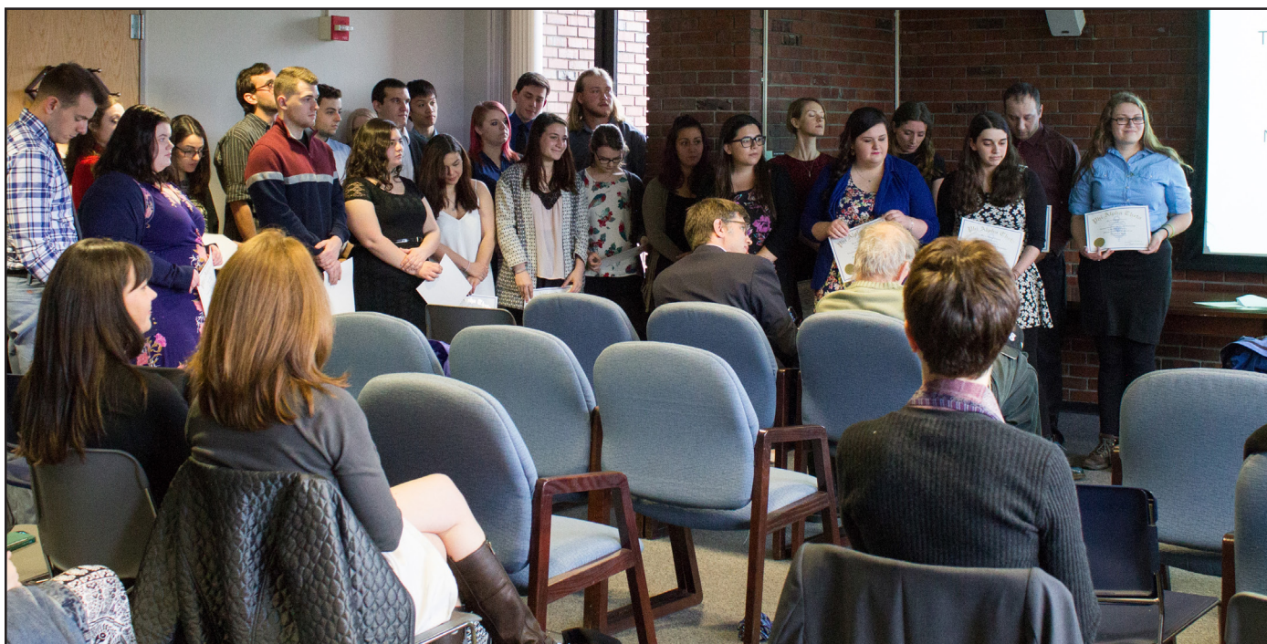
2016 Phi Alpha Theta Induction Ceremony