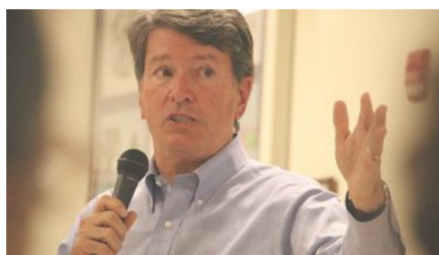
Faso faces constituents in Port Ewen In "Politics & Government"