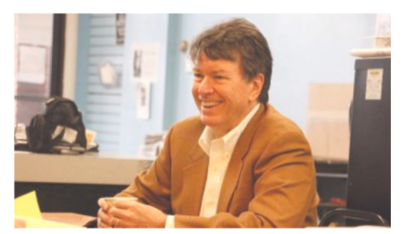
Faso passes on invite to Kingston 'town hall' meeting; calls format 'not productive'