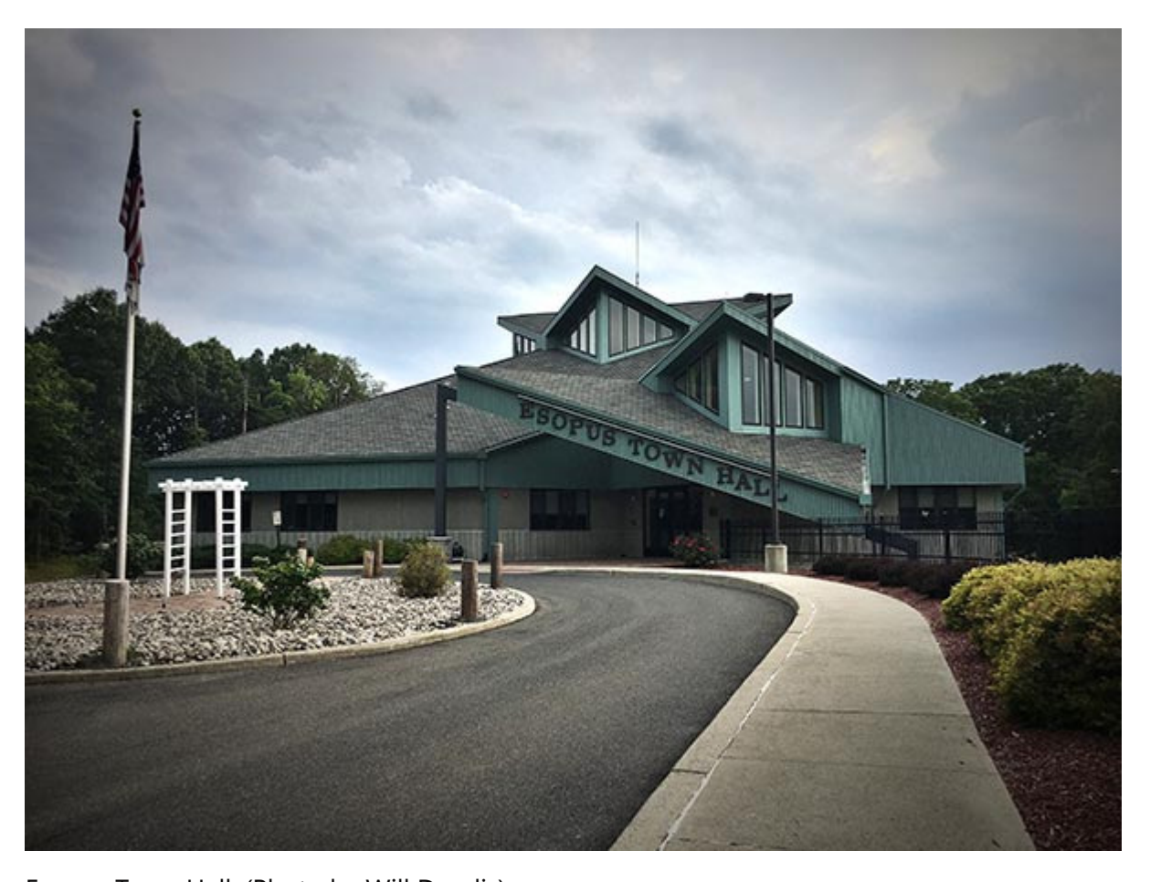
Esopus Town Hall.

questions which will be asked by the person who wrote it. Moderators will determine whether a follow up question is appropriate.