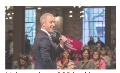
Maloney slams GOP healthcare plan, needles Faso In "Politics & Government"