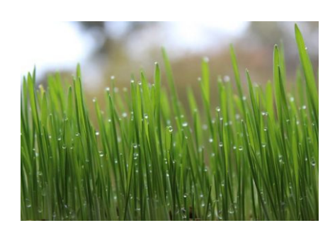
Saugerties "weed law" has teeth