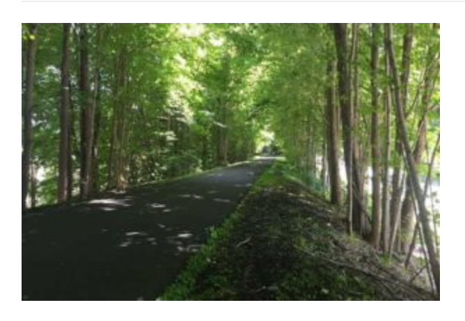
Poll: Should police patrol rail trails?