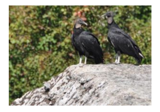
9 things to know about the black vulture