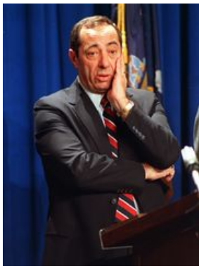
Former New York Gov. Mario Cuomo