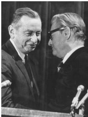
Lt. Gov. Malcolm Wilson is congratulated on Nov. 12, 1973 by Gov. Nelson Rockefeller (R) at the podium during an Albany news conference. Wilson, who has been No. 2 in the state for 15 years, will become governor at age 59.