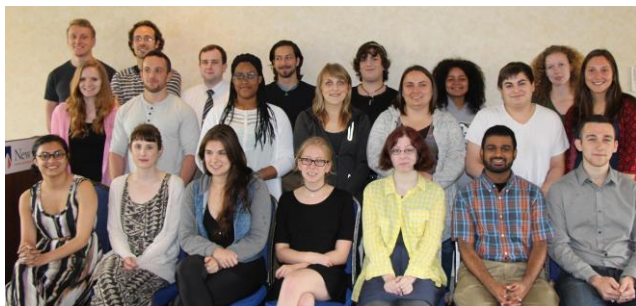
2016 SURE students

www.newpaltz.edu/research/usr_sure.html .