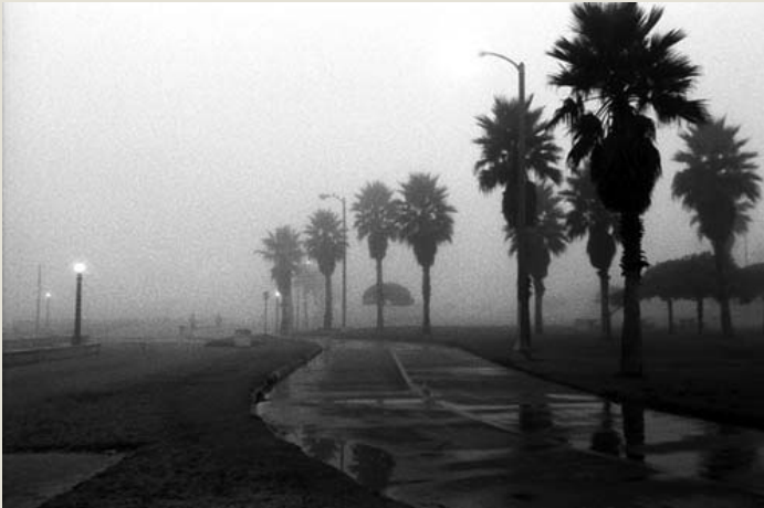
Helen K. Garber, Bike Path Fog , 2001, selenium toned gelatin silver print

A portfolio of black-and-white photographs taken at night in Los Angeles and New York City and inspired by film noir and pulp fiction.