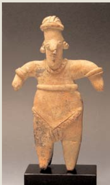
Unknown Pre-Columbian artisan, Standing figure, 100 BCE-300 CE, ceramic; gift of the Estate of Doris Lee Trust