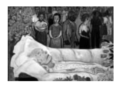
Death of Mother Bloor, ca. 1958 Oil on canvas, 26 x 36 in. (66 x 91.4 cm.) The Estate of Alice Neel; courtesy Robert Miller Gallery, New York