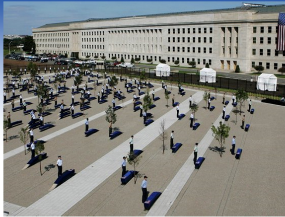
The Pentagon Memorial at the Dedication