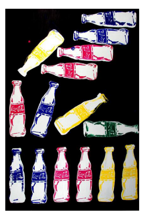
Coke Bottles By Connor Krill