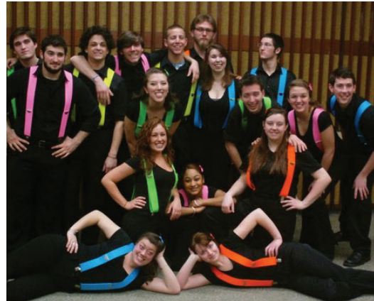
New Paltz's own student group, Absolut A Cappella, will sing at the Alumni Welcome Reception and All Class Mixer.

Event includes wine, beer, soft drinks, hors d'oeuvres, and musical entertainment by Absolut A Cappella, SUNY New Paltz's co-ed a cappella student group.